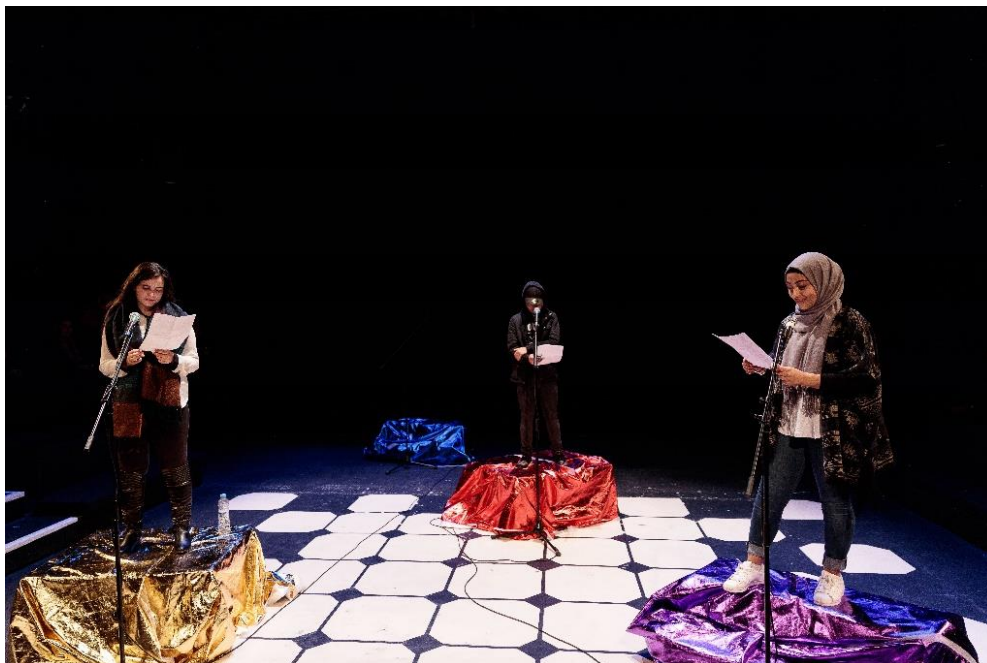
Image Credit: Bedfellows with Youth Forum, The Making Of... 2015

Support Structures for Support Structures is a fellowship programme initiated by Serpentine, that supports up to ten artists and collectives working at the intersection of art, spatial politics and community practice. The fellowship consists of an unrestricted grant of £10,000 or more to develop creative ideas as well as providing a network of support, development workshops and mentoring at a timely moment in the recipients' careers.